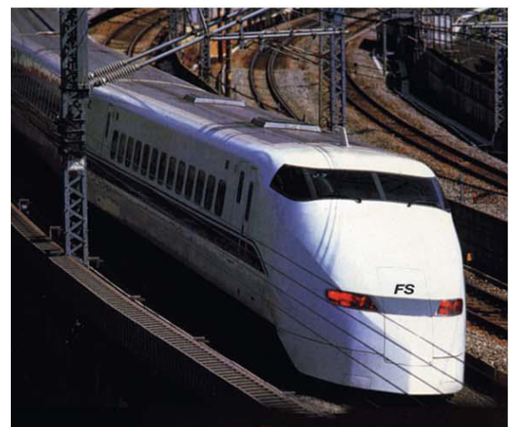
... and where electrical energy is used