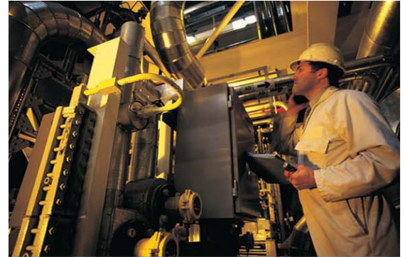
Fields occur when electrical energy is generated

International standardization bodies and organizations such as WHO, ICNIRP, IEC, IEEE, and CENELEC, as well as national authorities have for many years been working on establishing and updating the immission protection limit values or on product standards. There is no dispute about the short-term effects of high frequency and low frequency fields. Limits for the general public and in the workplace are in force practically everywhere around the world. However, such limit values on their own are not enough to protect people. They must also be verified by calibrated measurement to make certain.