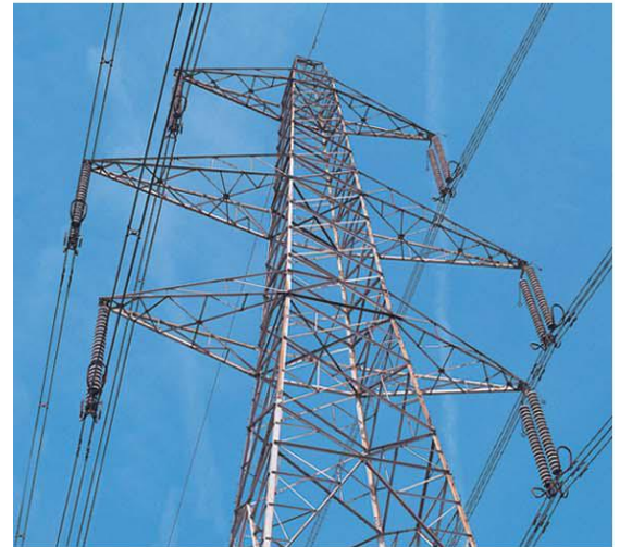
... where electrical energy is distributed