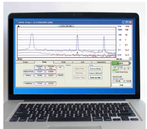
Measurement controlled by PC with EHP50-TS