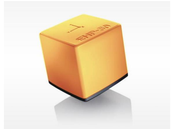
The compact case of the EHP-50F contains all the technology for measuring E fields and H(B) fields

The EHP-50F uses a Weighted Peak evaluation with convolution in the time domain that conforms to ICNIRP 2010 and IEC 61786-2. The measurement covers the entire frequency range from 1 Hz to 400 kHz. A graph shows the measured value versus time.