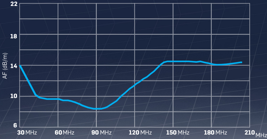
BC-01 - Antenna Factor @ 10m