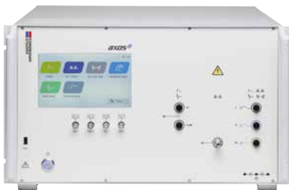
AXOS 8 front view

A wide range of cost-efficient and user friendly coupling / decoupling networks for power lines as well as for symmetrical and asymmetrical data- and signal lines are available as options.