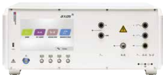
AXOS 5 front view

A wide range of cost-efficient and user friendly coupling / decoupling networks for power lines as well as for symmetrical and asymmetrical data- and signal lines are available as options.