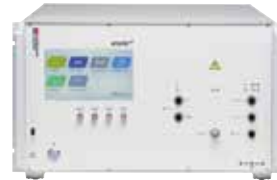
AXOS 8 Surge Test System Article no. 2490810

Surge 1.2/50 \mu s...8/20 \mu s IEC/EN 61000-4-5