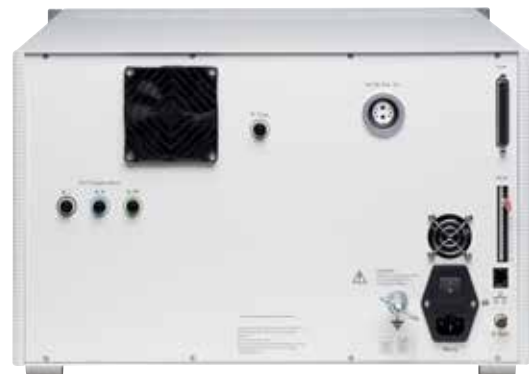
AXOS 8 rear view