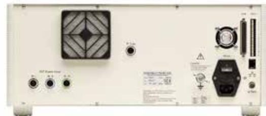
AXOS 5 rear view