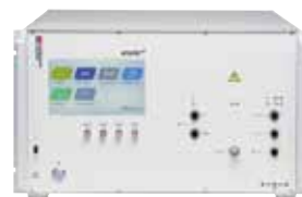
AXOS 8 EFT/Burst Test System Article no. 2490830

Surge 1.2/50 \mu s...8/20 \mu s IEC/EN 61000-4-5