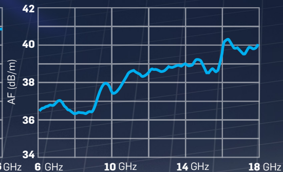
DR-01 - Antenna Factor