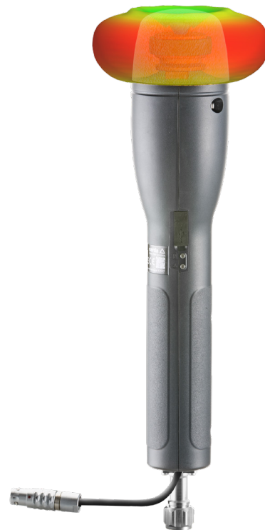
Fig. 2. 3591/02 Omnidirectional